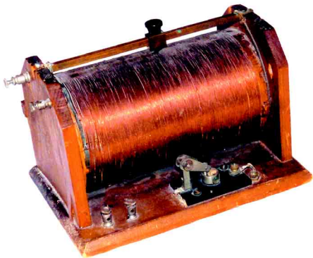
Yardley's crystal set, built in 1923 at age 9.