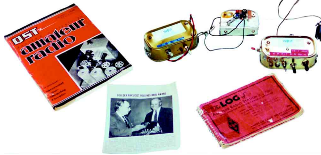
Three of W0JF's surviving Sardine Can transmitters.

Working at the National Bureau of Standards, he was involved with WWV